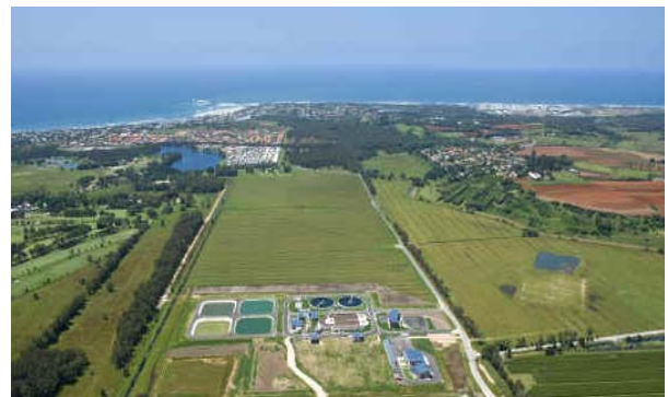
Kingscliff Wastewater Treatment Plant