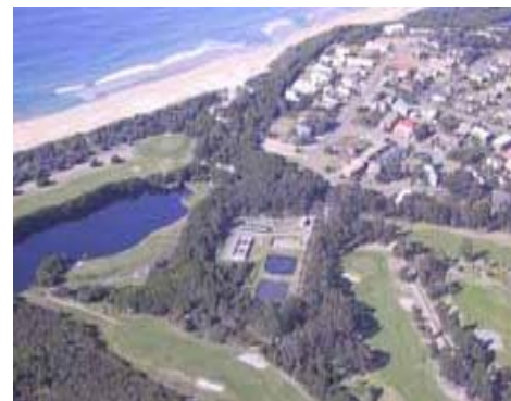
Tura Beach Sewage Treatment Plant

Even new STPs may result in odour emissions, due to operational practices. Best practice for both new and existing sewerage systems is the adoption of good operational practices such as an odour management plan (OMP). An OMP would specify odour operational and management standards and practices, and set out strategies and measures for minimising the risks of odour incidents and contingency actions for managing odour issues if they occur. (Refer to chapter 4)